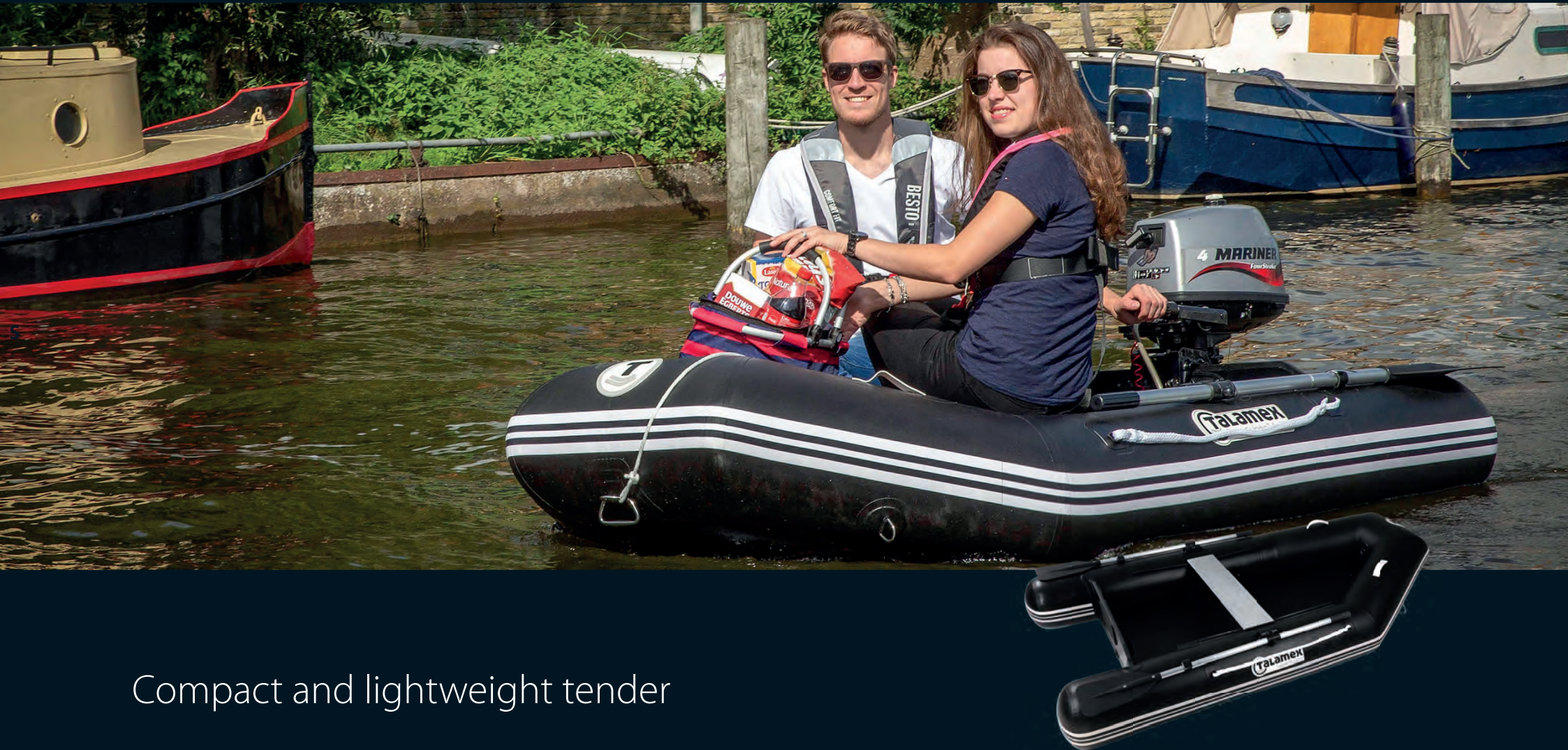
Compact and lightweight tender